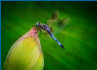
Best Color Blue Dasher Rose Epps