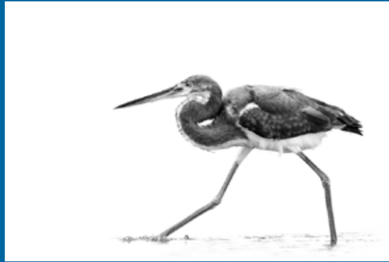
Best of Show Fine Art Series 3 Heron Cheryl Callen