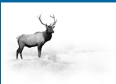
Best Contemporary Fine Art Series 3 Elk Cheryl Callen