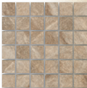
Mosaic (Musk shown)