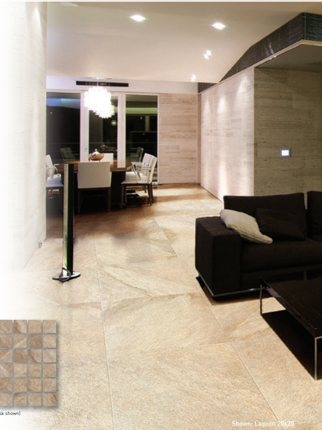
Shown: Lagoon 20x20