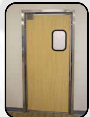
Shown in Natural Maple