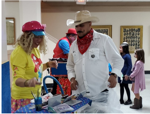
A great time was had by everyone at our 82nd Annual Chuck Wagon.