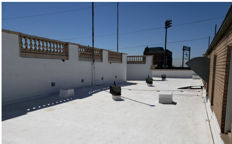
The renovation and recoating of the entire roof of the Temple has been completed.