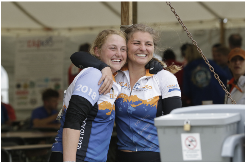
Members of the Texas 4000 Team, March 2019

LBJ 100 website: http://www.lbj100.bike/