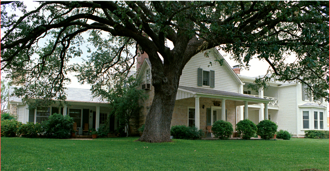
The Texas White House at the LBJ Ranch, Stonewall, TX.

The Friends of Lyndon B. Johnson National Historical Park work in partnership with the National Park Service to invest resources in three key areas of the Park, a national treasure nestled in the heart of the Texas Hill Country: education, preservation, and restoration.