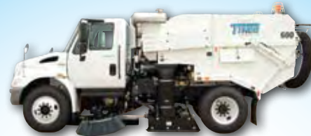
MODEL 600® Standard Cab