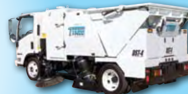
MODEL DST-4® Dustless Sweeping Technology