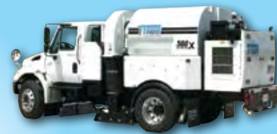
MODEL 500x® High Side Dump