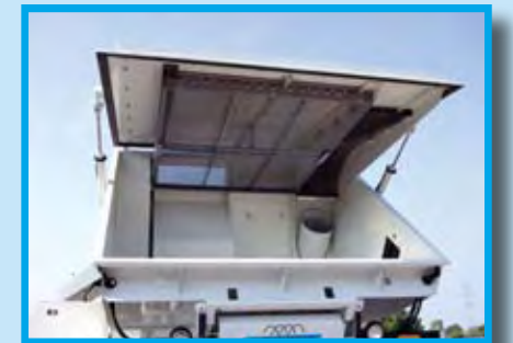
Extra large door allows for easy dumping and cleaning.