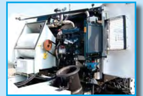
Locking side panels swing away for easy access to auxiliary engine.