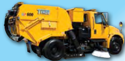
MODEL HSP® High Speed Performance for Airport Runways

Specifications subject to change without notice.