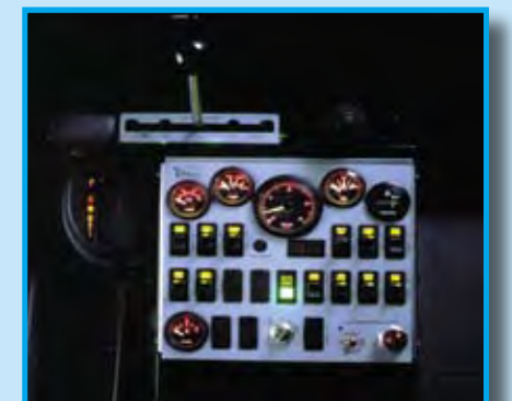
Sweeper Control Panel illuminates for easy night vision.

Sweeper photographs may contain optional equipment - Consult your dealer for more information