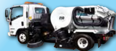
MODEL 210® Cabover

TYMCO REGENERATIVE AIR SWEEPERS are AQMD Rule 1186 Certified PM 10 -Efficient