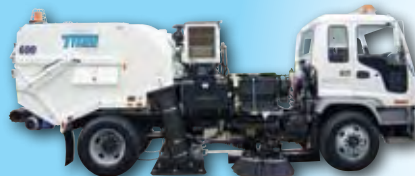
MODEL 600® Cabover