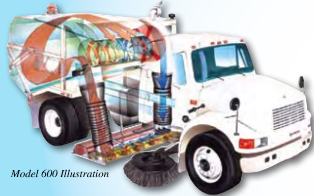
Model 600 Illustration

We want you to understand the Regenerative Air System and your TYMCO sweeper completely, so you can get optimal performance from your equipment investment. That's why, for more than twenty-five years, we've offered two-day scheduled training schools at our facility in Waco, Texas. Owners, managers, operators and mechanics get hands-on training and answers to specific questions. Enrollment levels are kept low, so you and your team will get personal attention as well as the opportunity to learn from the experiences of other attendees through the interaction of the class.