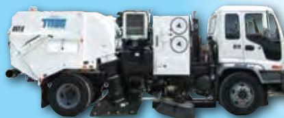
MODEL DST-6® Dustless Sweeping Technology