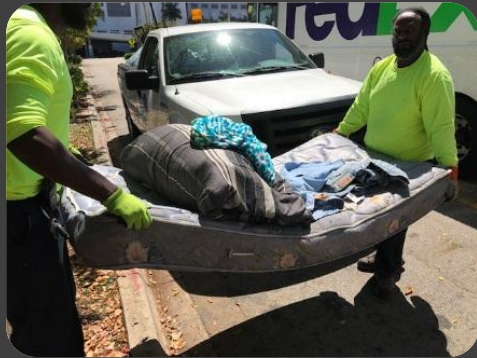
NET Cleaning Crew