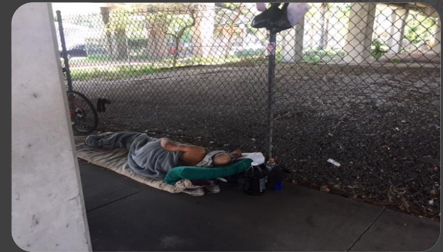
S. Miami CT & SW 25 th – 26 th RD August 2017

This homeless male is NOT violating Pottinger.