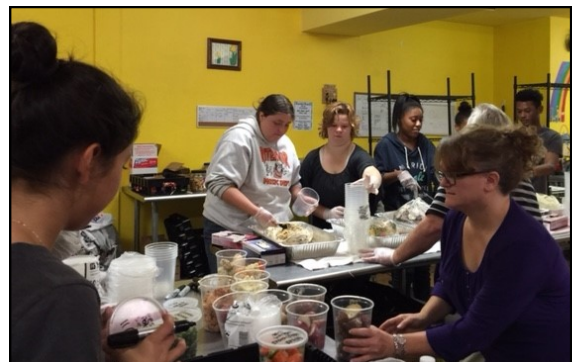
Ritenour HS students volunteering in the Food Pantry

If you would like to do something to make our community stronger, come and spend a little time in the food pantry! We need help stocking the store (T,W,F,S from 8:30am-noon), and processing pallets of food (M and F from 1-3pm).