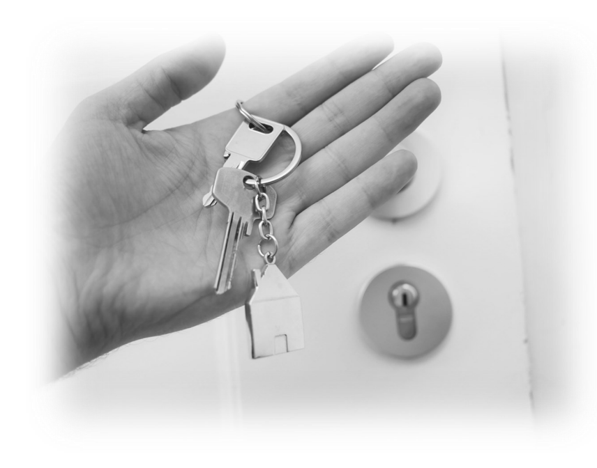
Philippians 2:4 <sup>4</sup> Let each of you look not to your own interests but to the interests of others.

The remaining Shrewsbury Parish Chesapeake Coalition for the Homeless bank account will be ultimately turned over to the new organization, but remain open for several months should additional donations be received during that time.