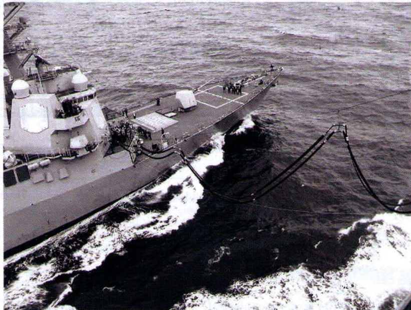
UNREP Ship, USNS WILLIAM McLEAN, refueling USS BAINBRIDGE (DDG 96)