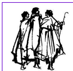
Table of Naomi

"After our Lord's death was over, the blood of animals was not the type, but the blood of the grape. That which was terrible in prospect is joyous in remembrance. That which was blood in the shedding is wine in the receiving. It came from him with a wound, but it comes to us with a blessing."