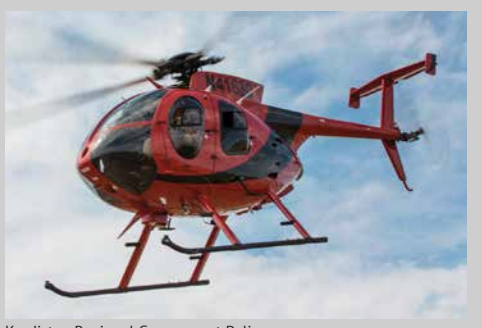
yon Railroad, LLC Kurdistan Regional Government Police