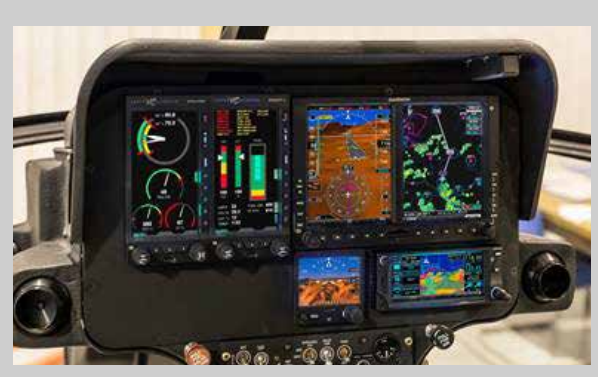
Glass Cockpit with Howell Industries Engine Instrument Display