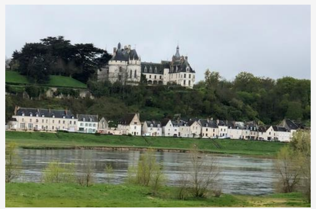
Figure 1. River Loire

An international internet crime wave unfolds before us. The extent of this international crime wave is unknown. On a recent tour to the Loire Valley in France, my wife and I were defrauded of more than $27,000, and I was threatened with false imprisonment in jail unless I immediately paid another $5,000 in cash. The tour operator, Luxury Tours France, received advance payment, and then falsely claimed that payment was not received.