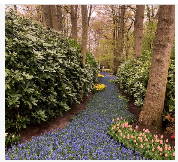
Figure 3. A river of flowers at Keukenhof Gardens, Lisse, Netherlands