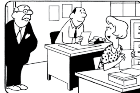
Differences: 1. Paper is missing. 2. Foot is missing. 3. Collar is added. 4. Phone is moved. 5. Desk legs are longer. 6. Man is standing straighter.

Send your tips to: Now Here's a Tip, 628 Virginia Drive, Orlando, FL 32803.