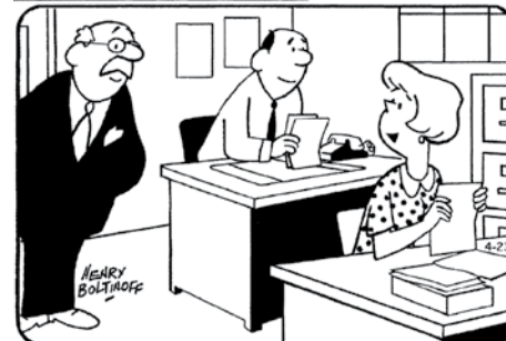
Find at least six differences in details between panels.