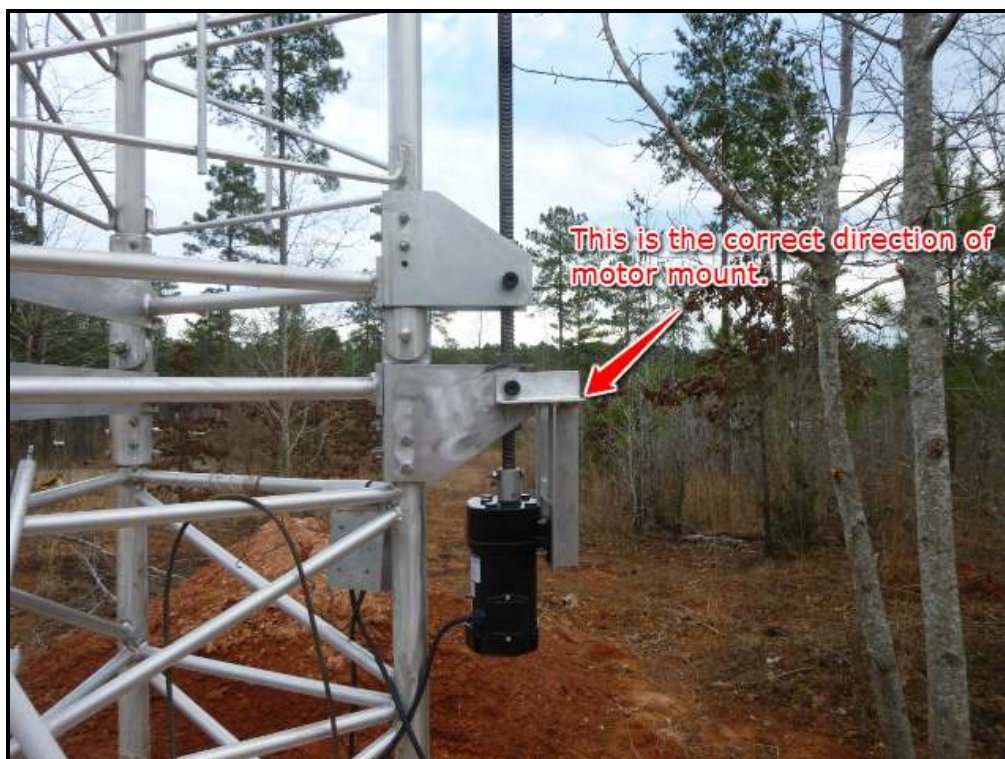
Pictured Above: Correct position of motor mount, side view. Mount is not symmetrical from left to right; therefore mount must be in a reverse 'F' position, not in a forward 'F' position, when looking at it from the side

After the Screw Actuator is fastened in place, you can begin to Fold the tower up or back down. You may then install or repair antenna or instruments at your convenience. (Again, please read Screw System Operating Instructions to become familiar with the proper operation of this product).