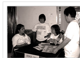
Training of Barangay Health Workers

This provides the opportunity for HAIN to propagate its framework in health education which places emphasis on a holistic primary health care approach where socio-economic and political factors are regarded as highly important to attain quality state of health.