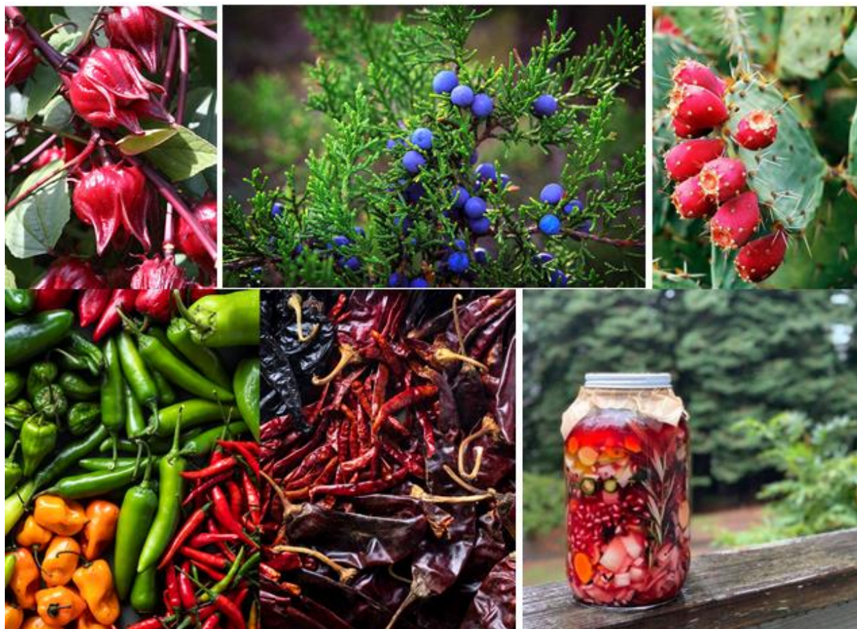
These pictures convey some of the vibrant Hill Country Christmas colors

Here and there bright Christmas colors decorated the winter landscape of subdued tans and grays. Maybe not as traditional as the old holly tree in my childhood front yard, but Christmas red and green made its appearance nonetheless - in the prickly pear fruits that escaped being eaten by the deer and in the fiery chili peppers gathered just before the first freeze. And while I was accustomed to the forests of Douglas fir "back home", the prolific cedars provided the evergreen promise of continued life throughout the winter season. Clusters of mistletoe added a splash of green to the highest branches of the leafless old oaks, and festoons of "old man's beard" decorated the gnarled limbs like the tinsel on my childhood Christmas trees.