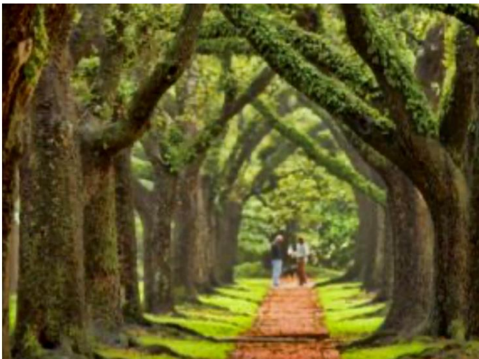
Root flares along Boulevard Oaks, South Blvd. 2020.

Update: I brought the volcano mulching problems to the attention of City of Bellaire officials and City Council by speaking and presenting a power point presentation on December 21, 2020. I was only allowed five minutes but had emailed information to them prior to the meeting. I doubt they can resolve the problems without endless debate. Stay tuned: I may instigate a "Free the Root Flare" grass roots initiative among concerned citizens. Can you dig it?