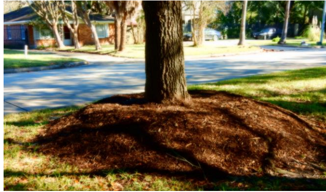
Volcano mulch on Bellaire Blvd. 2020

A wonderful video explaining all you need to know about mulching trees is available on YouTube. When you Google "Morton Arboretum Mulch," you will become a mulch expert in two minutes. Also, google Howard Garrett, aka "The Dirt Doctor," to see him narrate a slide show about improper volcano mulching and planting depth of trees. Guess which city he proclaims as the worst in the world for tree maintenance and preservation? Sad but true. Trees are incredibly valuable to our landscape and our future.