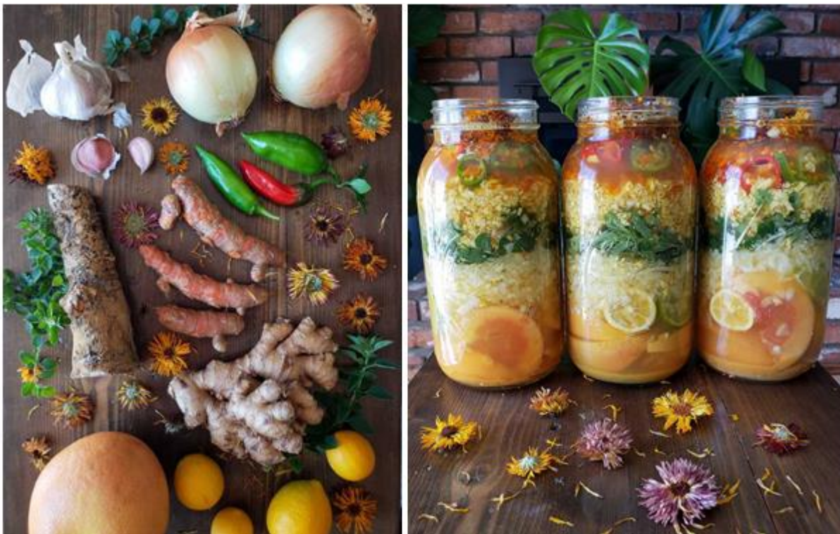
Start with the basic Fire Cider ingredients and then add your own special touches!

I had never made Fire Cider before, but, with flu season upon us and the ongoing COVID-19 pandemic to contend with, it seemed the perfect time to make a batch. Many believe that the regular consumption of this vinegar-based herbal elixir enhances immune function and either prevents, or reduces the severity and duration of respiratory infections. And while this claim has never been subjected to a scientific examination, Fire Cider does contain ingredients such as ginger, garlic, onions, turmeric, and horseradish that are known to fight infection, reduce inflammation, and relieve congestion.