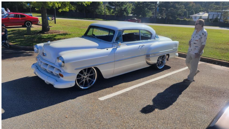
Brenda's 54 Chevy Bel-Air