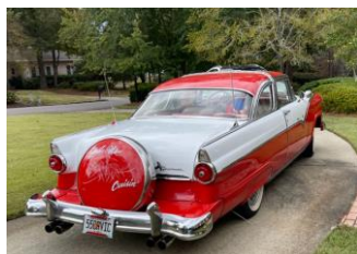
Judy's 55 Ford Crown Victoria