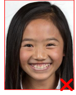
Smiling is not permitted – must be a neutral expression

Facial piercings, such as nose rings and studs, that are worn permanently by the subject, must not cause a reflection