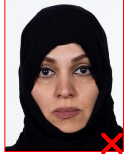
Head-coverings must not cover the face - same with hair