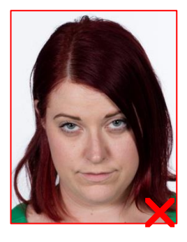
Head must not be tilted down or up