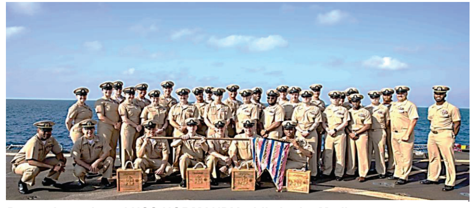
Promotions aboard USS NORMANDY while in the Mediterranean.