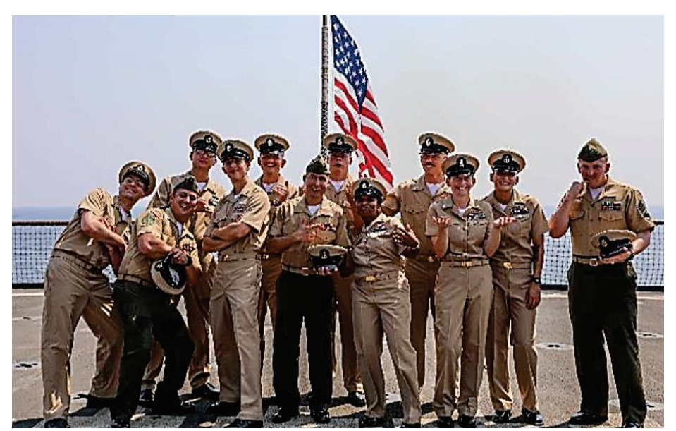
Chief Petty Officer Ceremony aboard USS CARTER HALL, Sept. 28, 2023.