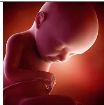
Stages of Human Life – Month 6