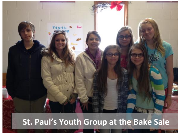
St. Paul's Youth Group at the Bake Sale

In November we had our Annual Youth Group Bake Sale & Bazaar! We raised a great amount to go towards upcoming expenses! Thank you for all of your outstanding support! We greatly appreciate it! Your continued support is outstanding! Thank you!