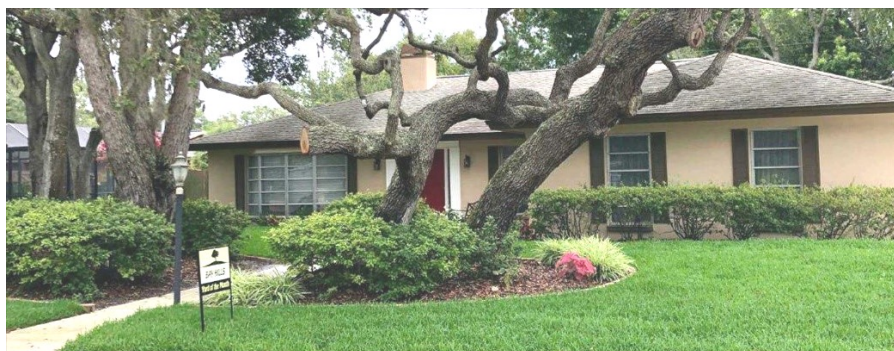
Above: JUNE, 14428 Tanglewood Right: JULY, 14534 Tanglewood