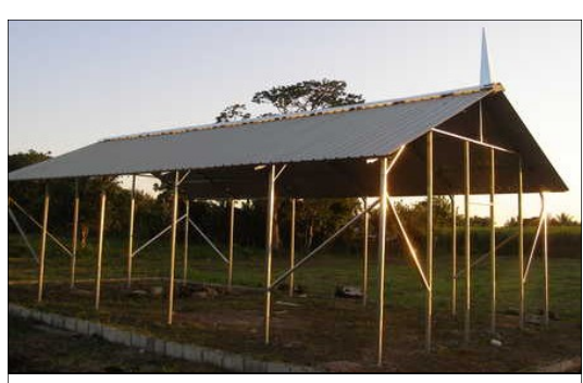
A One-Day Church is nearly completed thanks to efforts of Montana students. (Archie Harris)

resulted in over $750 dollars for the church project. A pie auction sponsored by the Home and School Association completed the $1,500 needed for a One-Day Church.