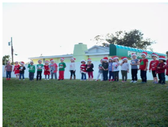
Christmas songs being performed by the children of Cornerstone during our Christmas Festival.

We recognize that birthdays are very special for young children and some parents may want to send in a treat for their child to share at school. However, the Health Department does not allow home-made food and some children have food allergies. We also ask that you limit the number of treats you bring in to one specific treat, such as mini cupcakes or cookies.