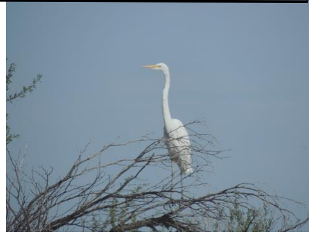
Snowy Egret at Crystal Reservoir