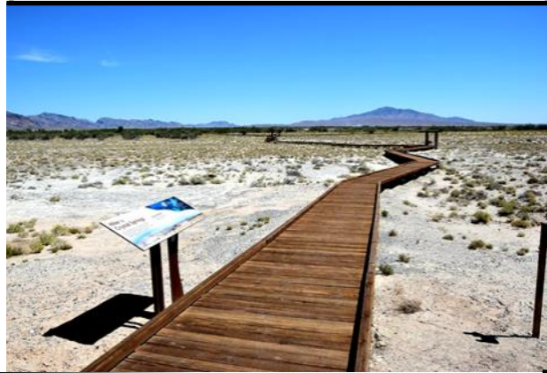
Some of the Boardwalks at Ash Meadows