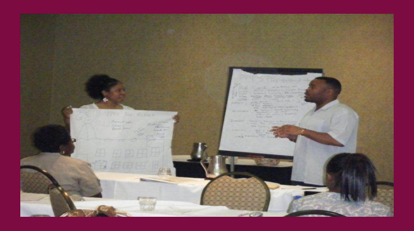
Doubletree By Hilton 800 National Parkway * Schaumburg, IL 60173

Saturday, June 10, 2023 10:00 am – 4:00 pm