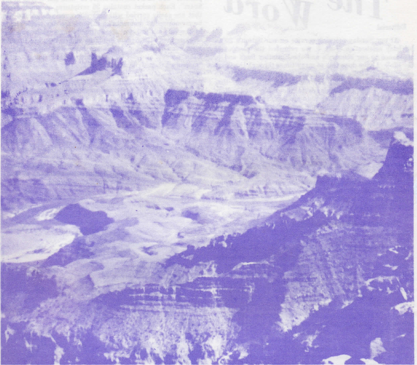
This is a view of the Grand Canyon taken by Brad Busch