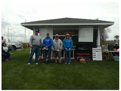
4<sup>th</sup> Place Winners