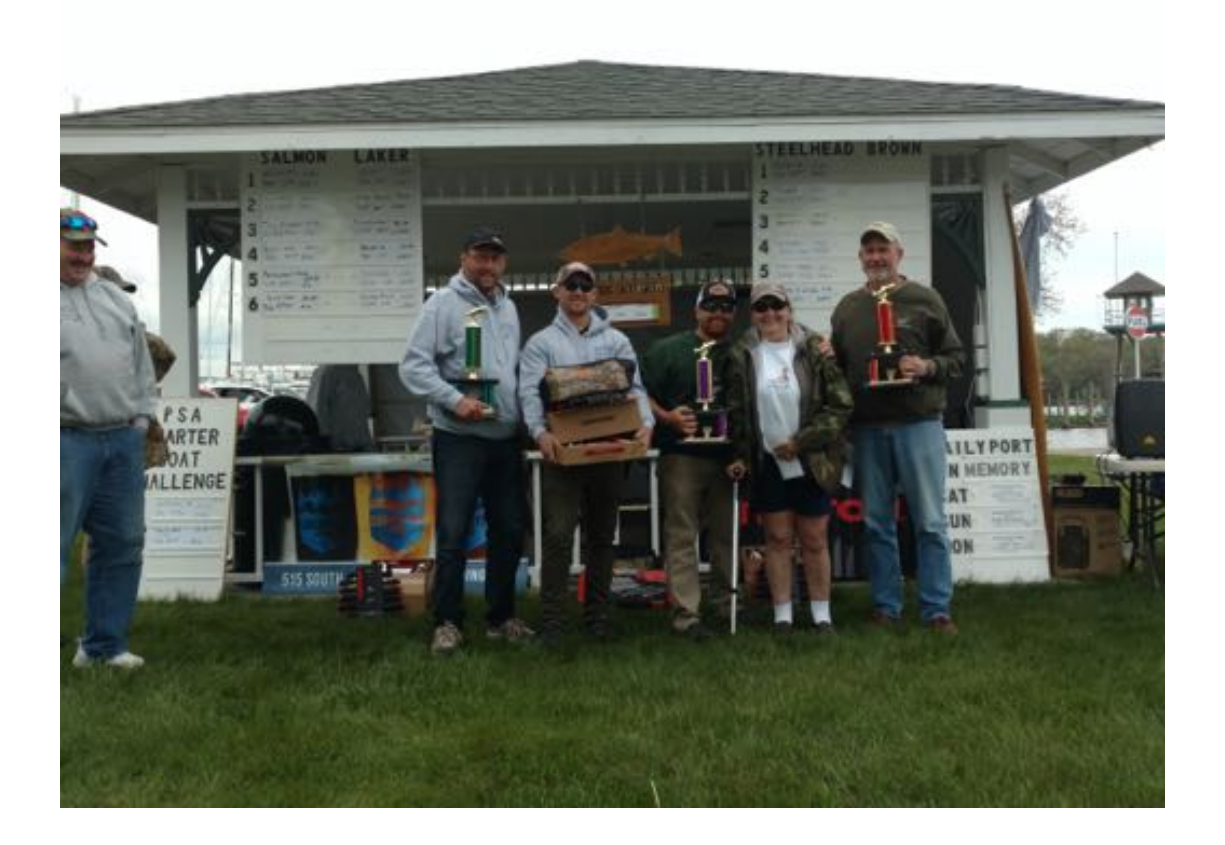
1st Place Teams – Highway Man, Sculpin, and Desperado