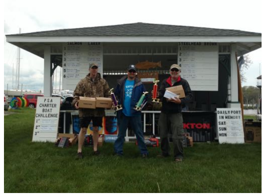
2<sup>nd</sup> Place Winners