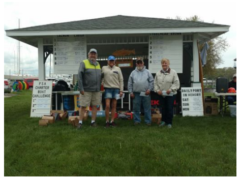
3<sup>rd</sup> Place Winners