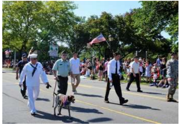
Post 346 Legionnaires march proudly.