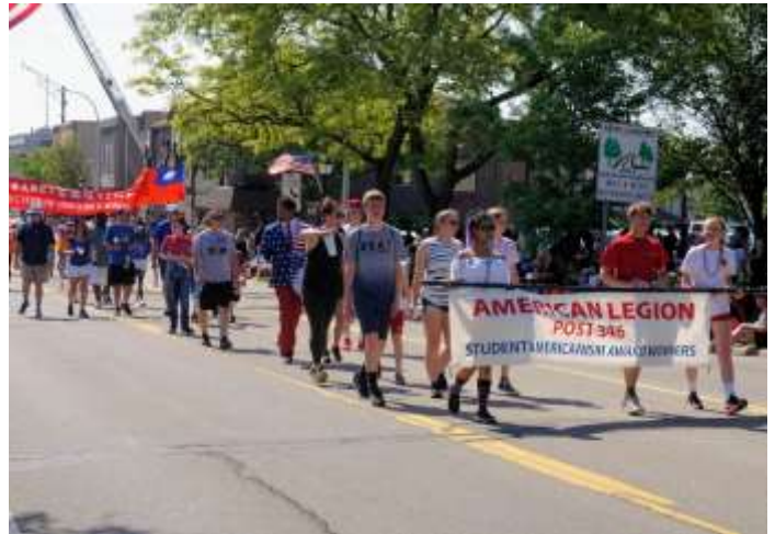
Post 346 Student Americanism Essay award winners.