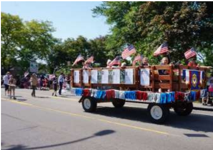
The Auxiliary shares their ride with members from the VFW. Thank you to the City of Farmington Parks and Rec. Dept. for the use of their wagon and to Weingartz Lawn and Garden in Farmington Hills for towing us.

Stay away from negative people, they have a problem for every solution. - Albert Einstein