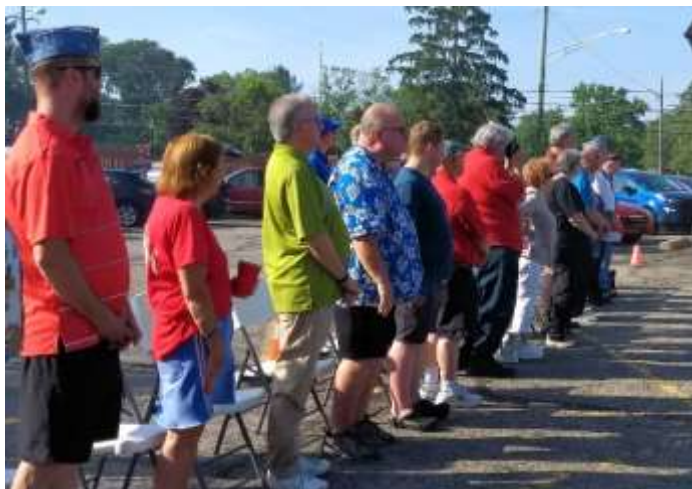
Many family, friends and community neighbors joined us for the ceremony.