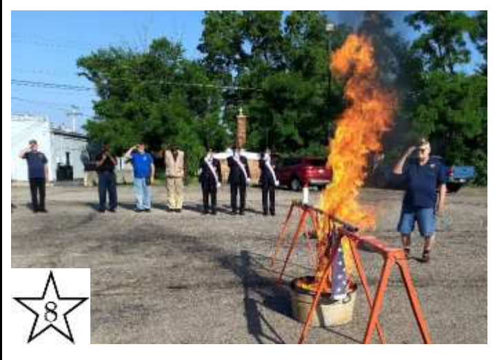
Disposed of with dignity, patriotism and honor.