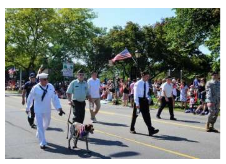
Post 346 Legionnaires march proudly.