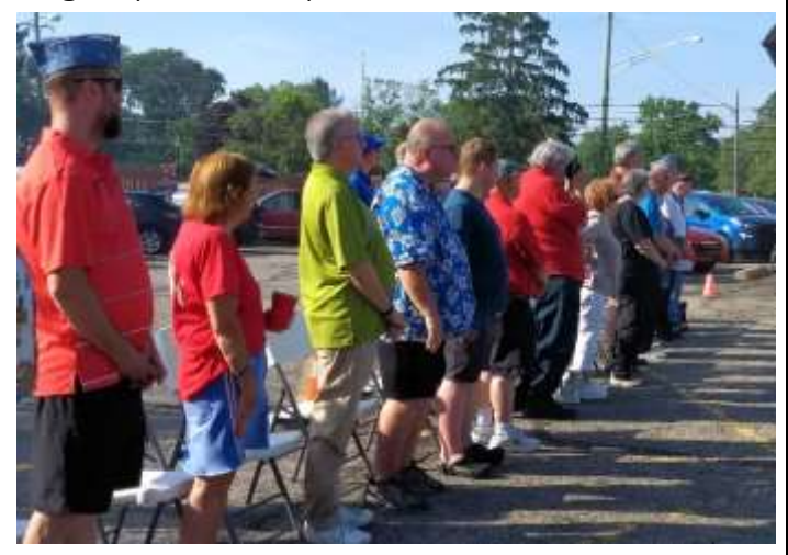
Many family, friends and community neighbors joined us for the ceremony.