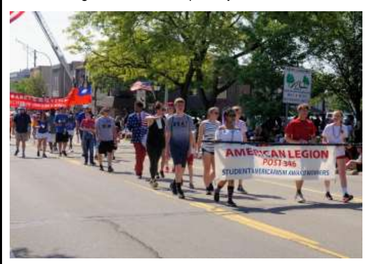
Post 346 Student Americanism Essay award winners.