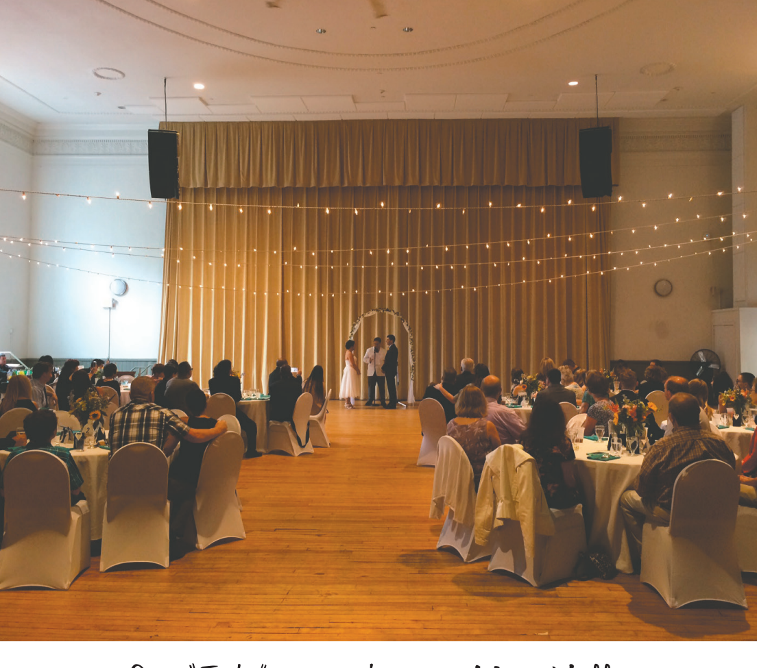
Say "I do" in our historic Main Hall