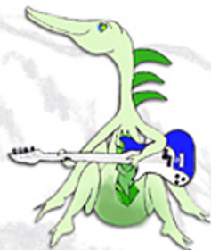
Scout (plesiosaurus + grasshopper = plesiohopper)