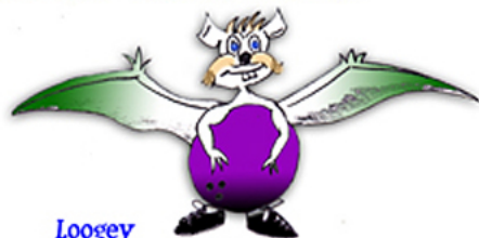
Loogey (squirrel + pterodactyl = squirrodactyl)