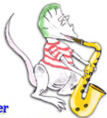
Grover (triceratops + mouse = triceramouse)

Half a Dinosaur + Half an Animal = The Radisaurs!