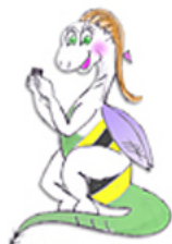
Auna (brontosaurus + bumble bee = brontobee)