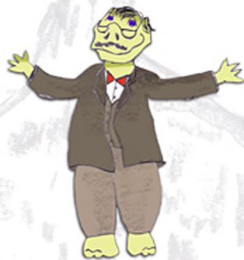
Hayward Beardsley (tyrannosaurus rex + hippopotamus = tyrannopotamus)