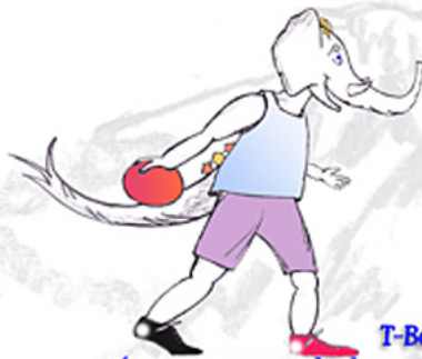
T-Bone (stegosaurus + elephant = stegophant)