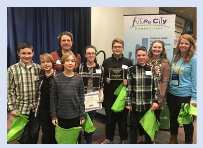
2019 ASCE SIS Award - Century City from Gizmo-CDA

This year's competition theme is Clean Water: Tap into Tomorrow! As the students are tasked with identifying an urban water system and then imagining, researching, designing, and building a futuristic solution to ensure a reliable supply of clean water. Come and help us support our future engineers and potential ASCE members!