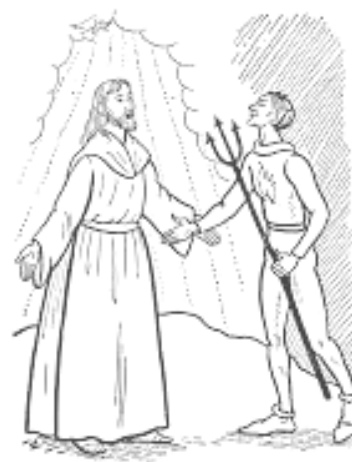
Jesus went into the wilderness and fasted forty days and nights. There He was tempted by the devil.