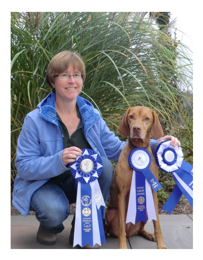
November 5th, she earned a High In Trial !

Happy 14th Birthday to these littermates on Feb. 18th, 2015