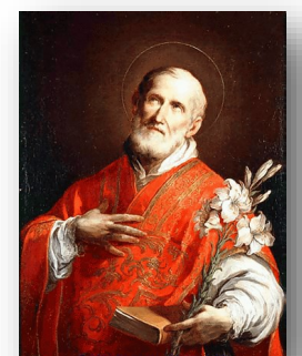
Feast Day: May 26

From a very young age, Philip was known for being cheerful and obedient. He was affectionately referred to as "good little Phil." At age 18, Philip went off to live with a wealthy family member in San Germano to assist with - and possibly inherit - the family business. Soon after his arrival, Philip experienced a mystical vision, which he eventually spoke of as his Christian conversion. He soon lost interest in owning property or participating in the business. He felt a call from the Holy Spirit to radically live for and serve the