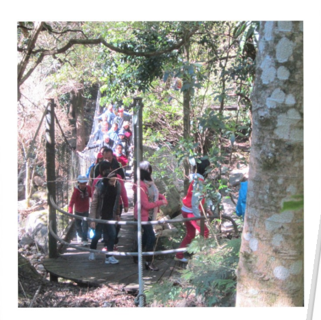
FATHER'S DAY TRIP