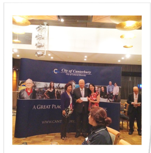
REPSENTATION AT CANTER-BURY CITY COUNCIL