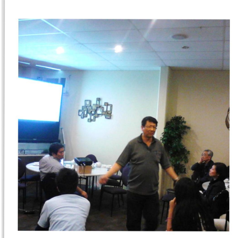
DAD TO DAD