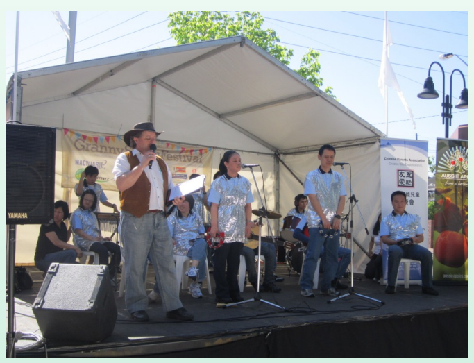
Granny Smith Festival 2012