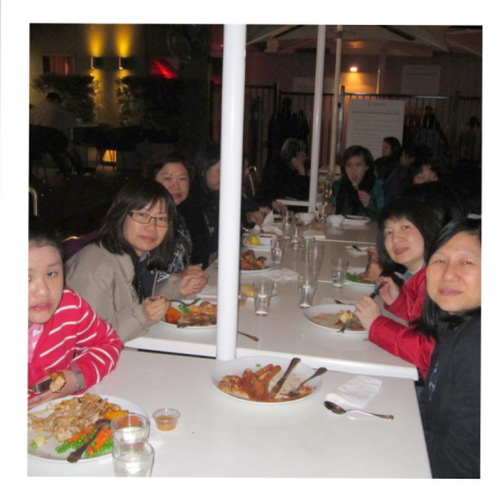
MUM TO MUM