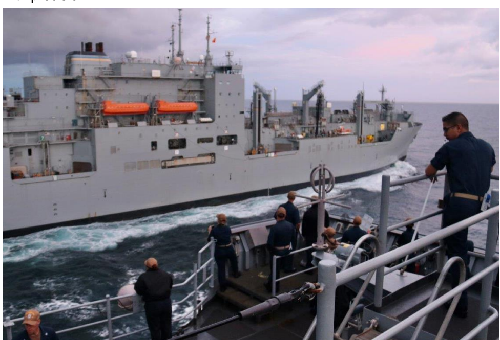
USS CARTER HALL underway fuel replenishment with USNS MEDGAR EVANS.