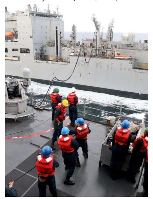
USS CARTER HALL underway fuel replenishment.