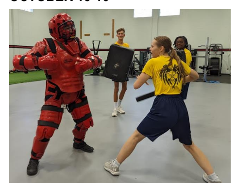
Sea Cadets receive vigorous training in self-defense.