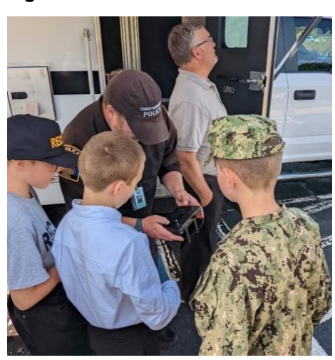
"Hands-on" drone training.

Richmond Navy Sea Cadet Corps is accepting applications for about ten cadets. If your 10-17-year-old is looking for an amazing journey focused on leadership and fun, then this is the organization for your child. We are supported by the U.S. Navy and the Richmond Council Navy League. This is a leadership program NOT a disciplinary program. The initial expense is $175 for uniforms then a small fee annually. The Sea Cadet Corp has training opportunities all over the country and internationally, our drill is one weekend a month, generally from 7:30 AM to 4 PM (both Saturday and Sunday) and we try to work around your child's sports This year we are working on STEM by building drones from SCRATCH. This includes basic physics and electronics. Our unit. AMERICA Division, is one of the top units in the country!