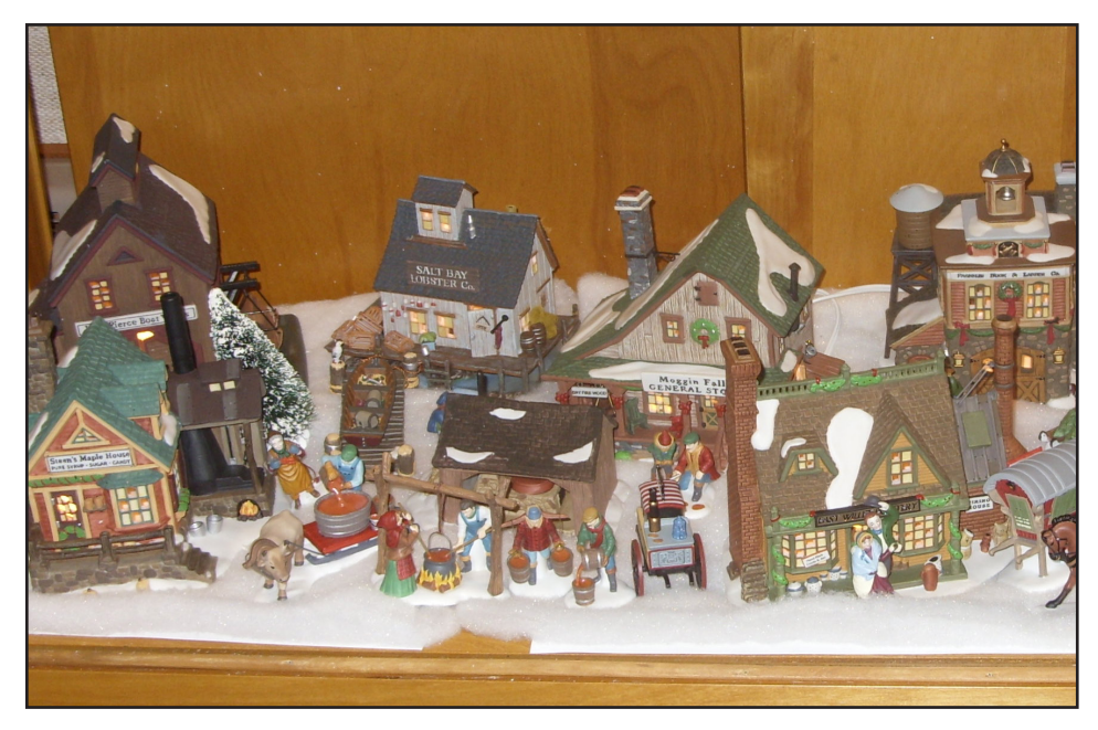
This is just one of several displays of the Department 56 New England Villages ready for the viewing public.

Before the 1800s, Father Christmas was Britain's mid-winter festival figure. He was usually dressed in green and was a reminder that spring was on the way. Sinterklaas (from Holland) became St. Nich-