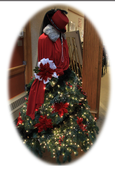
This is one example of the decorations for Christmas at the Carnegie's Victorian inspired event.