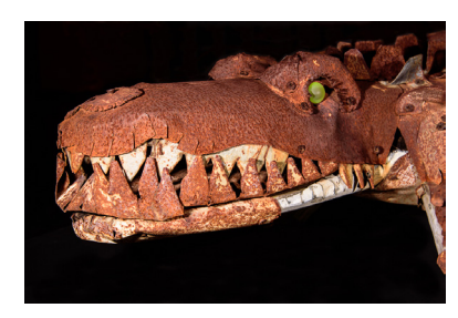
Rusty Gator - 27 Dolph McCrainie