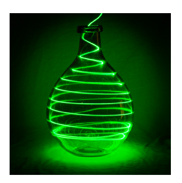
Green Vase - 26 Ken Uplinger