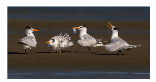
Family Discussion - 27 Cheryl Callen