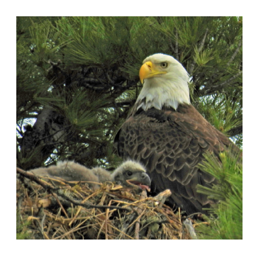
Bald Eagle with Chick - 27 Lewie Barber