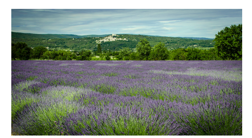
Lavender Field, Provence - 27 Kathy McCall