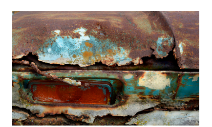
Find the Fish - 26 Beverly Lyle