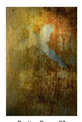
Rusting Dove - 27 Linda Sheppard