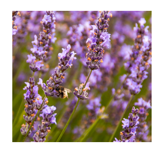
Lavender Bee - 26 Diana Dworaczyk