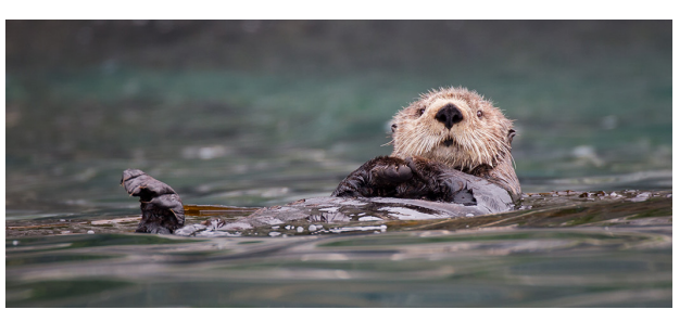
Floating Sea Otter - 26 Leslie Ege