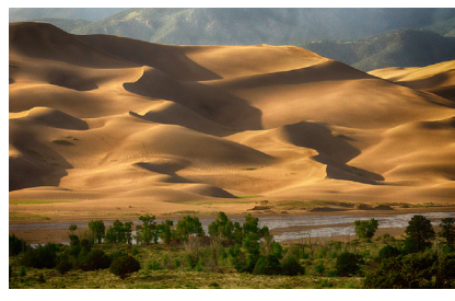
Rocky Mountain National Park - 26 Jeff Lava