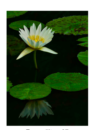
Tranquility - 27 Stennis Shotts