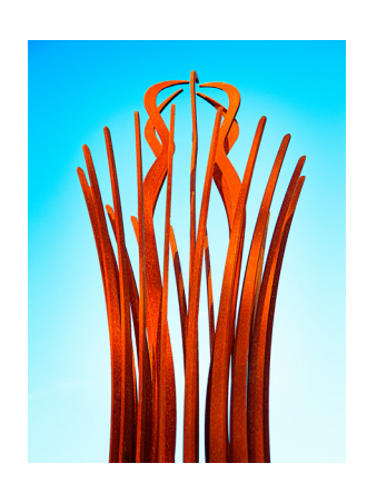
Rust Blossom - 27 Linda Spencer