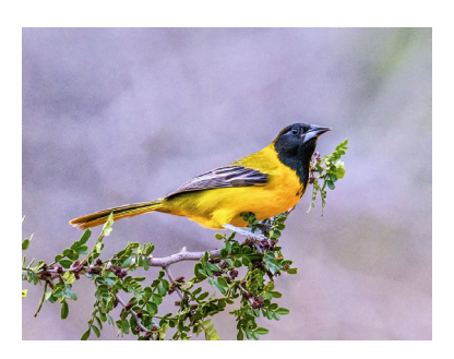
Audubon's Oriole #1 - 27 Paul Munch