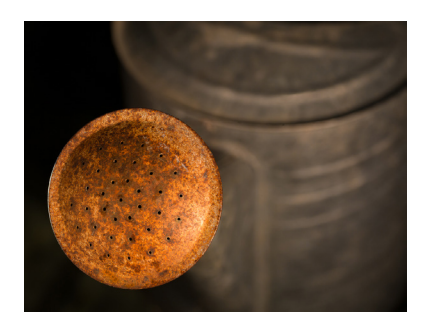
Watering Can - 26 Linda Avitt