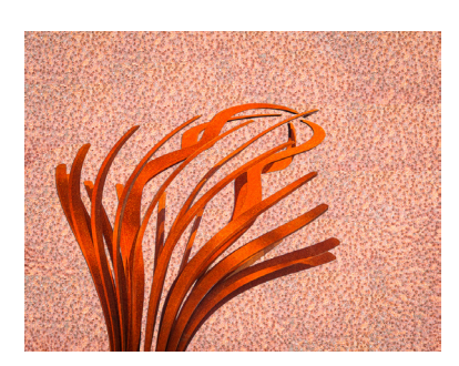
Rust Blossom 2 - 26 Linda Spencer