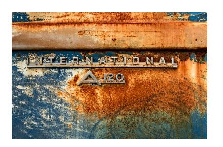
International A120 - 27 Linda Sheppard