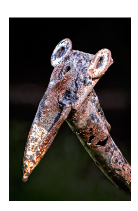
Old Rusty Pecker - 26 Kushal Bose