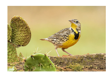
Meadow Lark #1 - 27 Paul Munch