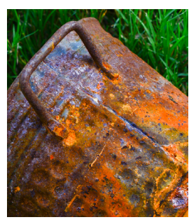
Bucket of Rust - 26 Pamela Oldham