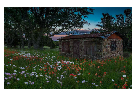
Little House - 27 Stennis Shotts