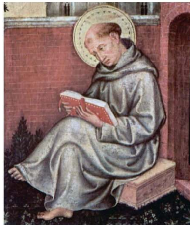
DETAIL THOMAS AQUINAS

—The Redemptorists Sundaybulletin@Liguori.org