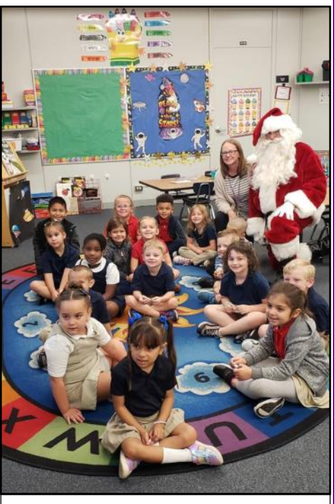
FL2-G sponsoring an elementary school and wishing everyone a Merry Christmas and a Happy New Year!