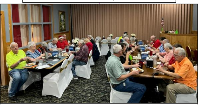
FL2-B2 Christmas Party!