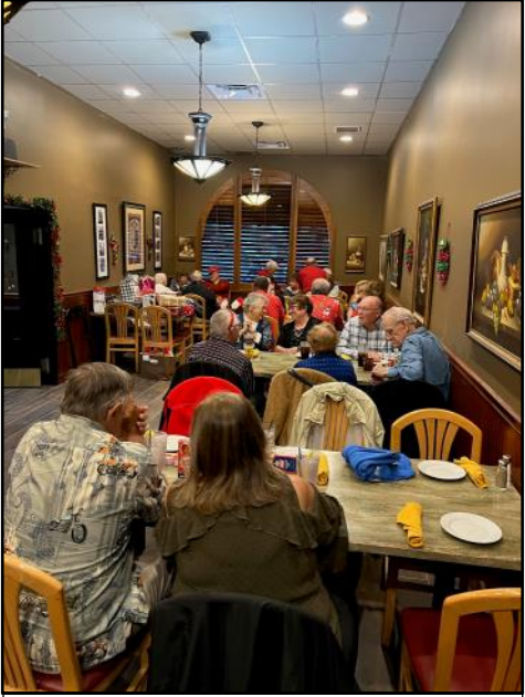
FL2-F Christmas Party!