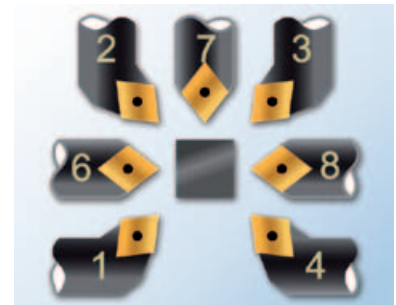
Perfect solution – software for touch probe and laser system available