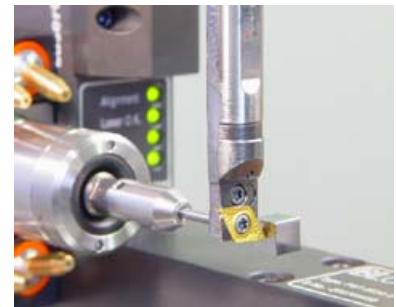
Extremely fast measurement of non-rotating tools