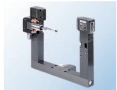
Customary laser system