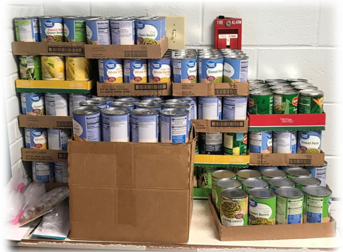
...Received this donation of 252 cans for the Mt. Hermon Food Pantry!