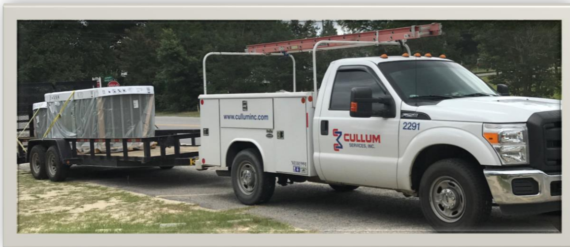
...New Air Conditioning Unit for the Sanctuary...