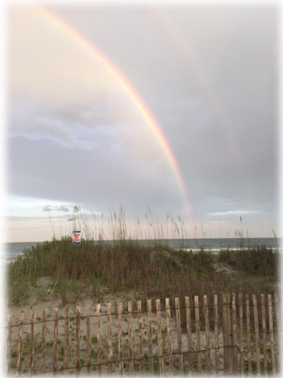
...Clouds at Sunset Beach and a double rainbow...