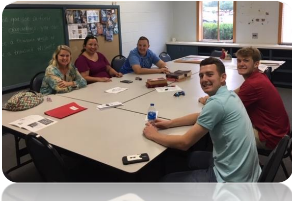
Young Adults in Sunday School!...