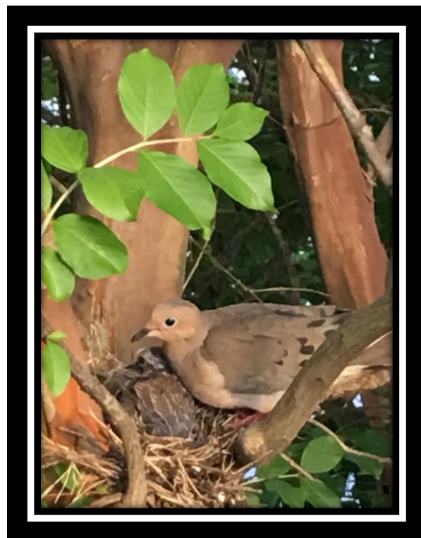
...Mama and baby...