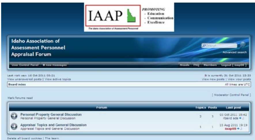
Figure 2. IAAP's Idaho Appraisal Forum

information can be beneficial for all, as it is our belief that utilization of this tool will facilitate appraisal practice and uniformity statewide.