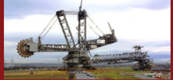
The World's Largest Earth Mover Built by German company, Krupp