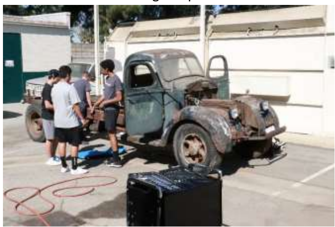
The 1938 International draws an admiring crown of students when it arrives at Bonita High School

"Hands on History" program and make an appearance in parades and city events. It is a project in which we can all take great pride.