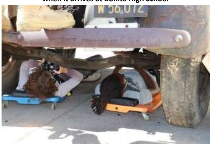
A BUSD student works under the 1938 International next to a photographer from the San Gabriel Valley News Group