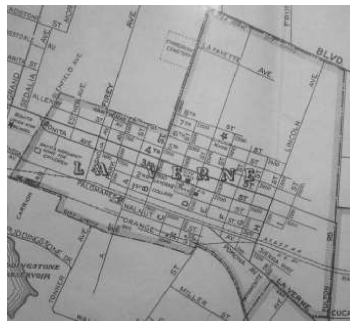
Map showing the La Verne City Limits at the time of the proposed street name change

Many out-of-town people looking for addresses on "Bonita Avenue" in La Verne have a hard time finding them, not knowing that "Bonita Ave." turns the corner at the High School. A change of name to "Third Street" would eliminate this confusion. The Planning Commission urges immediate action on the above recommendation.