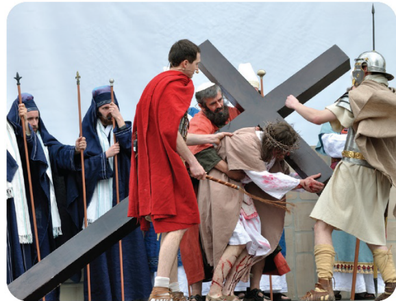
GOMA KAWARI, A. HOLLAND / STA. NISIBANI / TOKYO / SHUTTERSTOCK