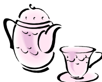
Victorian Tea at the Brick Tavern Museum.

Price per person is $12, ages 10 and under $6. Please call