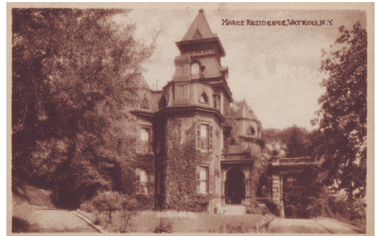
The Magee Manor, also known as Glenfeld, in Watkins Glen. The Manor was demolished in 1960.

The building of their home, the Magee Manor, aka "Glenfeld," began in 1869. It was at the time the most modern building in Schuyler County. The manor itself had running hot water, gas lights, and a bowling alley. The property featured horse