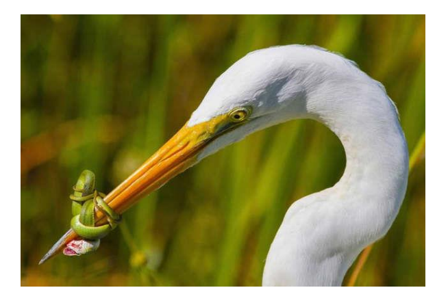
Don't Ever Give Up?

Even among the "churches of Christ," ungodly and unrighteous doctrines are being adopted, and by them, "the way of the truth shall (is being) evil spoken of" in order to cast a bad light upon those standing for the truth. Indeed, the words of Isaiah ring out, "Woe unto them that call evil good, and good evil; that put darkness for light, and light for darkness; that put bitter for sweet, and sweet for bitter!" ret